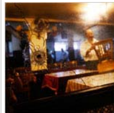
In Mumbai, a Raucous Cafe Defies Terror