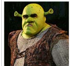
The Belching Ogre Has a Song in His Heart

Home | World | U.S. | N.Y. / Region | Business | Technology | Science | Health | Sports | Opinion | Arts | Style | Travel | Jobs | Real Estate | Automobiles | Back to Top