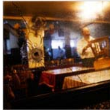
In Mumbai, a Raucous Cafe Defies Terror