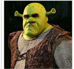
The Belching Ogre Has a Song in His Heart

Home | World | U.S. | N.Y./Region | Business | Technology | Science | Health | Sports | Opinion | Arts | Style | Travel | Jobs | Real Estate | Automobiles | Back to Top