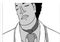
Letters: Say 'Ahhh,' While the Doctor Yawns