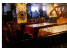
In Mumbai, a Raucous Cafe Defies Terror

The loan giant will sign new leases with renters in foreclosed properties.